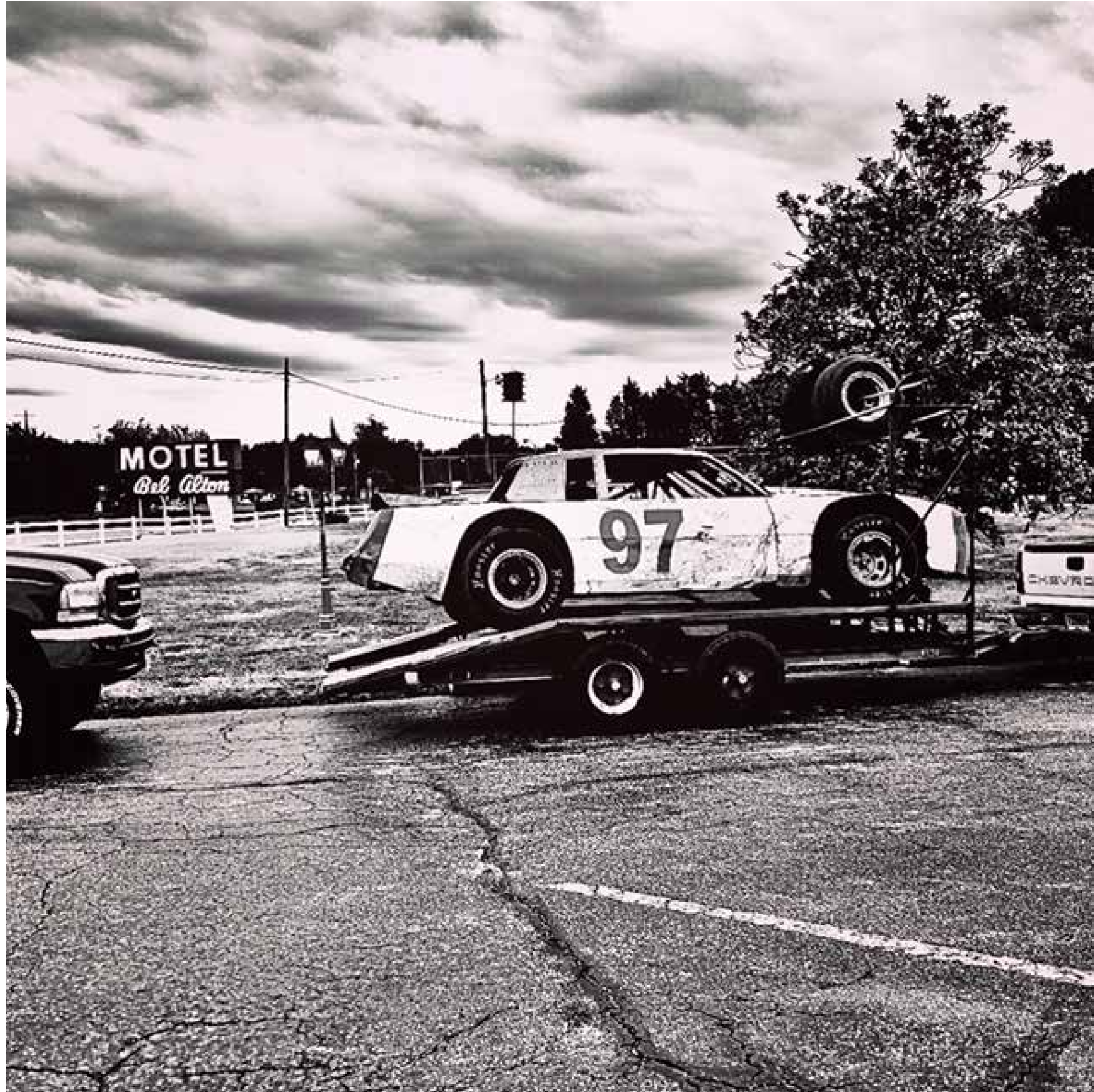
After Race Morning WILLIAM C. CRAWFORD